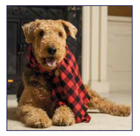
Name: Titus Merski Breed: Airedale Terrier Age: 5

Some folks think that all we dogs care about is eating, sleeping and playing. But the truth is, we're more interested in the law than you may think – and particularly in pet protection laws!