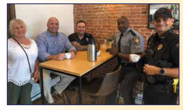
'Coffee with a Cop' was a great opportunity to trade thoughts with some of our area's finest.