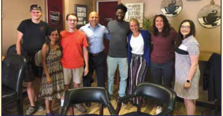
Young adults from around the community shared great ideas at our Millennial Brunch.