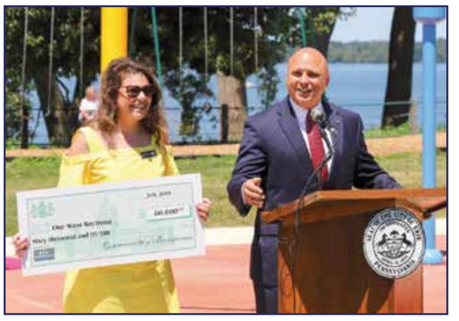
Our West Bayfront received a $60,000 grant to fund a new splash pad for Bayview Park.

grades, enhance teacher training, boost career readiness and provide special adaptive equipment.