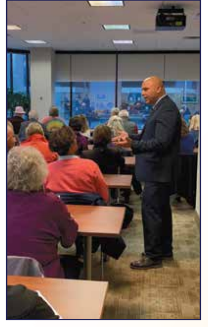
My Medical Marijuana information session drew an inquisitive crowd.